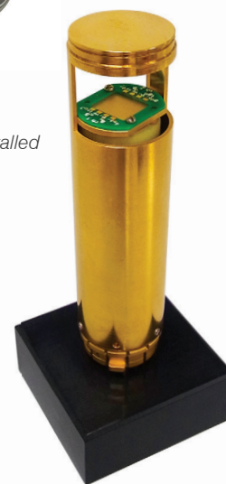
ADR with transport puck installed

Included user kit for the ADR with additional transport pucks and a USB drive with archived thermometry calibration files.