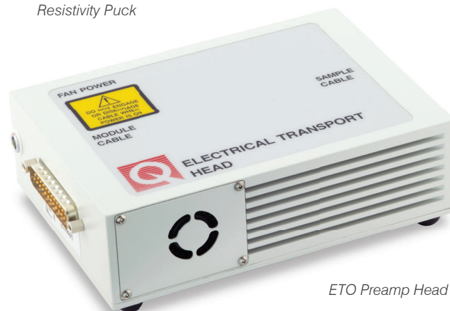
ETO Preamp Head