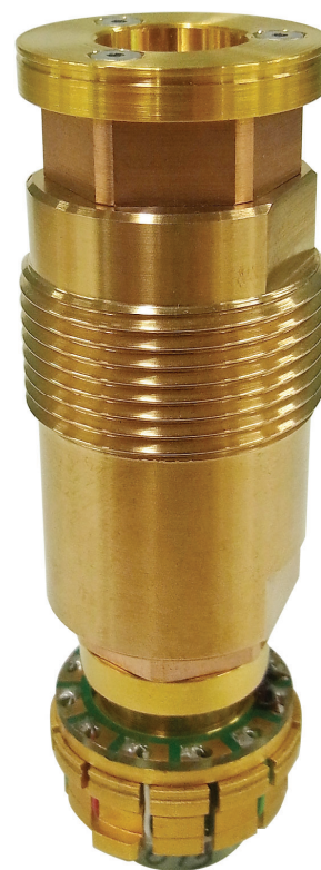
High Pressure Cell for Electric Transport Measurements

1.8 to 400 K; 0 to 9 T www.qdusa.com | sales@qdusa | Re: 1084-500 Rev. A2 Specifications are subject to change without notice.